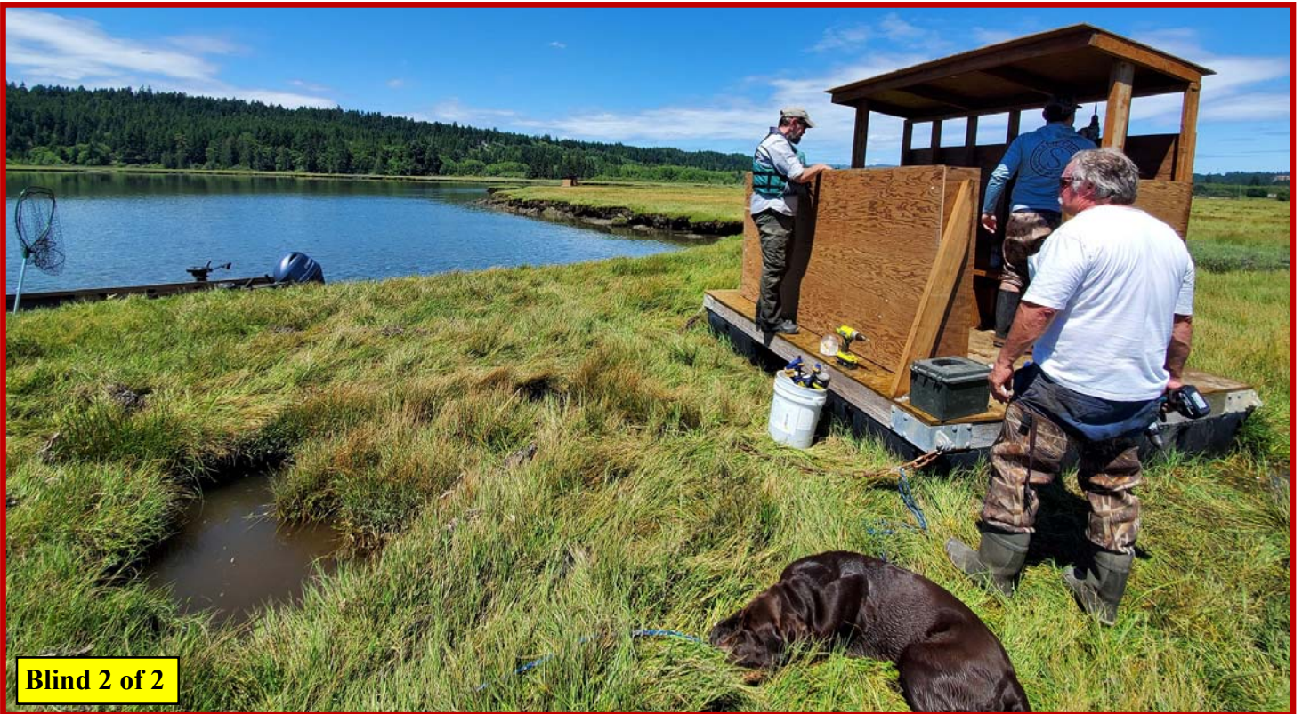
Blind 2 of 2