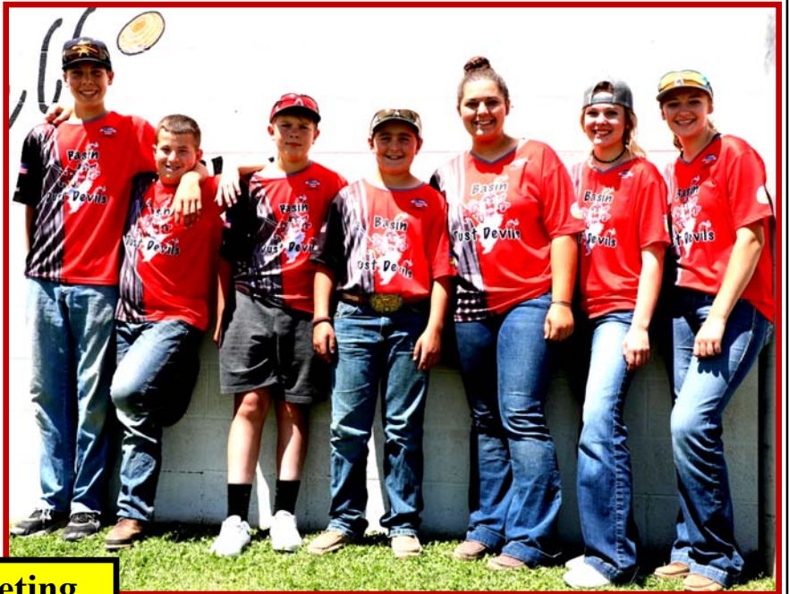
Basin Dust Devils High School Shooting Team sponsored by the WWA-Moses Lake Chapter.