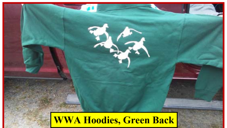
WWA Hoodies, Green Back