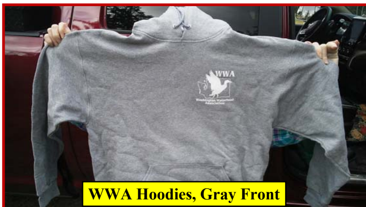
WWA Hoodies, Gray Front

16409 Canyon Rd. E. Puyallup, WA 98375 (253) 537-6151 www.tacomassportsmensclub.com