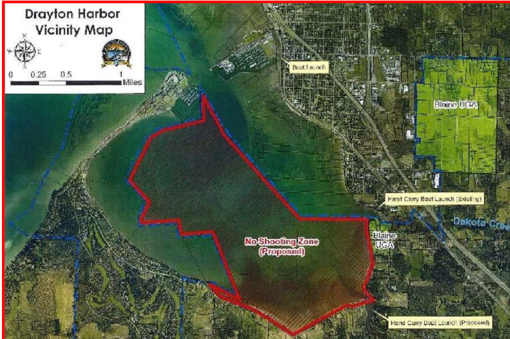
No Shooting Zone – Drayton Harbor Area

PROPOSED BY: CITY OF BLAINE INTRODUCTION DATE: SEPTEMBER 24, 2019