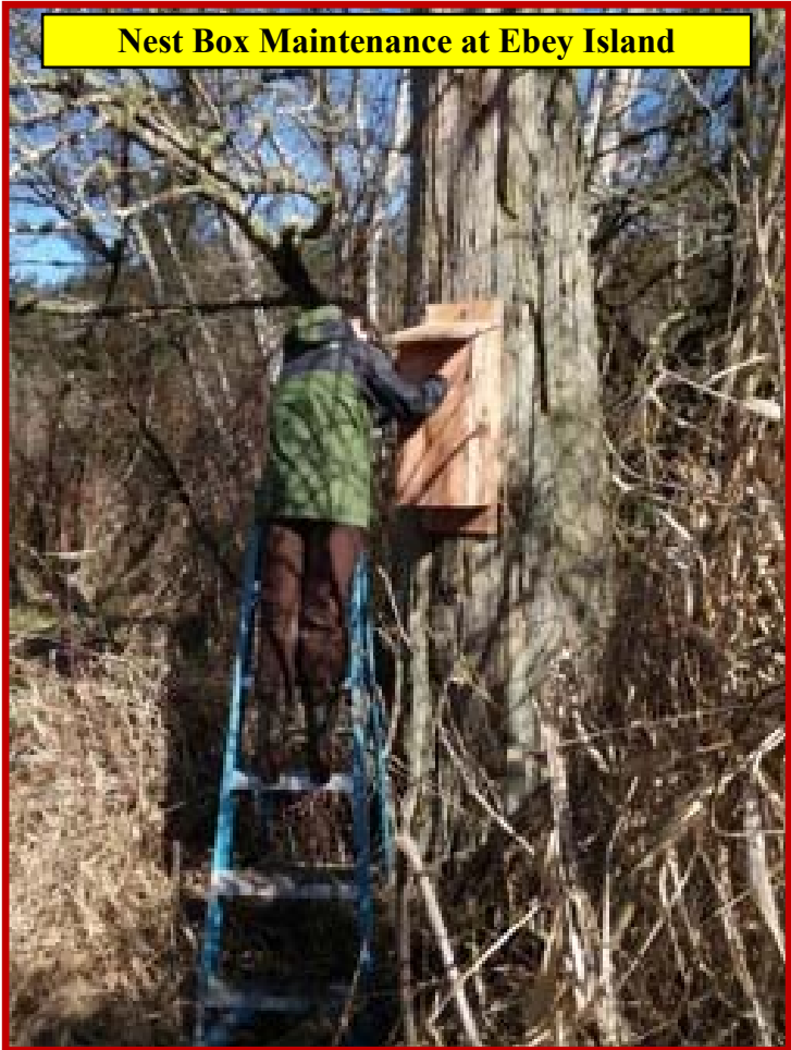
Nest Box Maintenance at Ebey Island